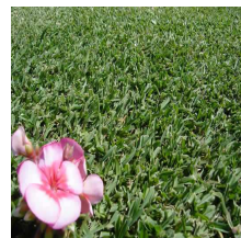
Buffalo (St Walter)